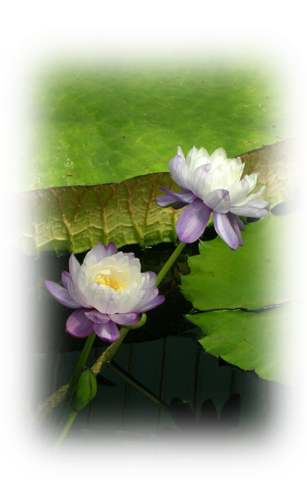
The Pet Loss Support Page www.pet-loss.net